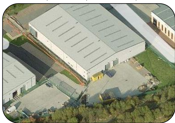
Below: Aerial view of the station, and the secure yard where we're permitted to park while on shift.

4 th January 2015: Our newest base location for our south rota bike has just gone live, and will hopefully save many of our riders from having to delay the start of their shifts while they take the previous rider back to their home. The idea is simple; drive up in your car or on your bike, and park it securely inside a locked gated compound with 24hr CCTV monitoring. Collect the blood bike, and either stay until your first call comes in, or take the bike back home if you live nearby. At the end of the shift, simply return the bike, collect your car, and go. Alan Ross took advantage of the new base on his first nightshift of the year. "Handovers are a lot quicker; my first call was only minutes after 7pm, when I would normally be taking the previous rider home in my car. Also, my shift was a Sunday night, so there was nobody taking the bike for 7am on Monday. I didn't have to arrange to drop the bike with the next rider anymore, I just text him once it's back at base & he can collect it whenever he's free to, much more practical!"