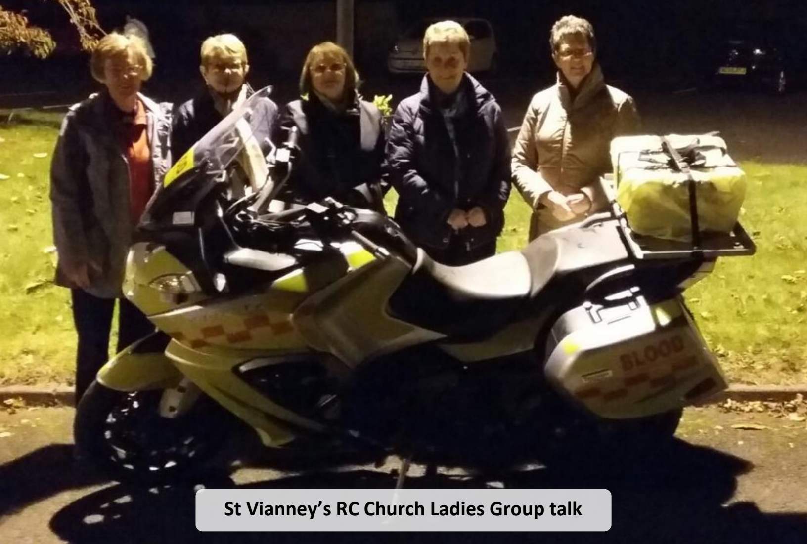
St Vianney's RC Church Ladies Group talk