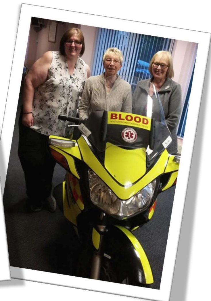
Top left: Springwell Ladybirds and Top Right: Murton WI