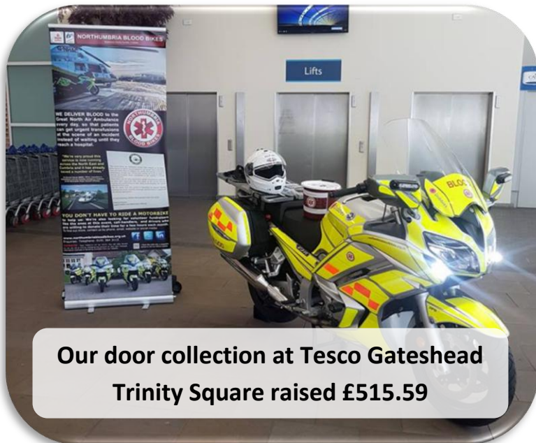
Our door collection at Tesco Gateshead Trinity Square raised £515.59