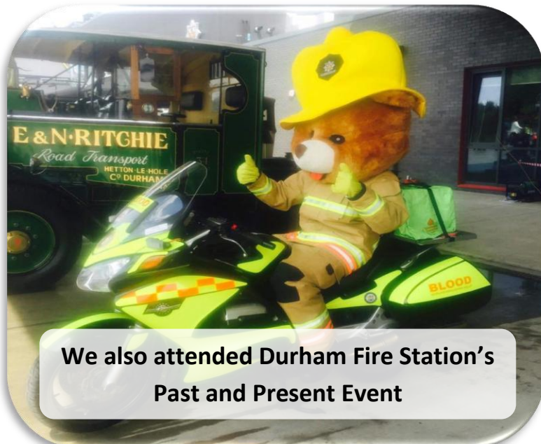
We also attended Durham Fire Station's Past and Present Event